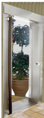
Solid Acrylic Daygate