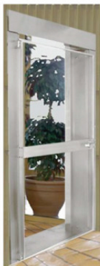
Standard Style Daygate

Constructed of special grade steel and high strength concrete the Thor III may be installed where weight constrictions limit installation