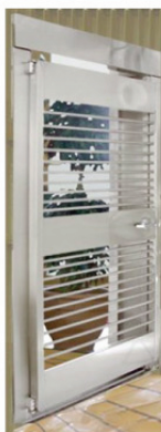
Rod Style Daygate