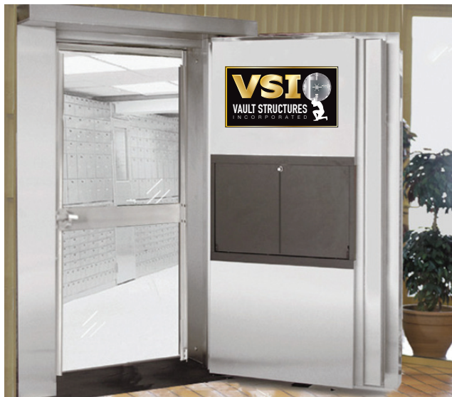
Door shown with optional custom logo